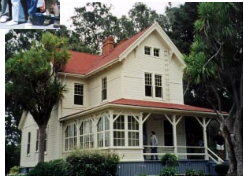
Officers Quarters on the San Francisco Presidio

showing plans to preserve the many buildings and sites within the Presidio grounds. The trip was much too short, and the trip ended with many expressing plans to return soon to see the "rest of the story." ~