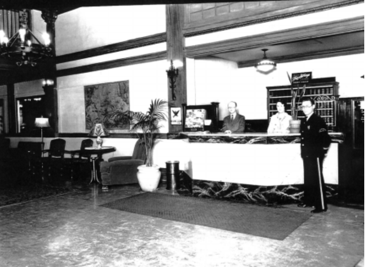
Montgomery Hotel Lobby circa 1920s

nal location. Unfortunately the wonderful ballroom in the annex has been demolished because there was inadequate clearance for the annex at the hotel's new location. Visit our web site (www. preservation.org) for more information and pictures of the ballroom. At the end of the current project the building will undergo seismic retrofit, the exterior will be restored and the hotel will be ready for interior restoration.