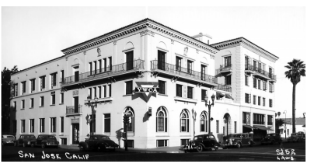
San Jose YWCA, built in 1914, razed in mid-1970s