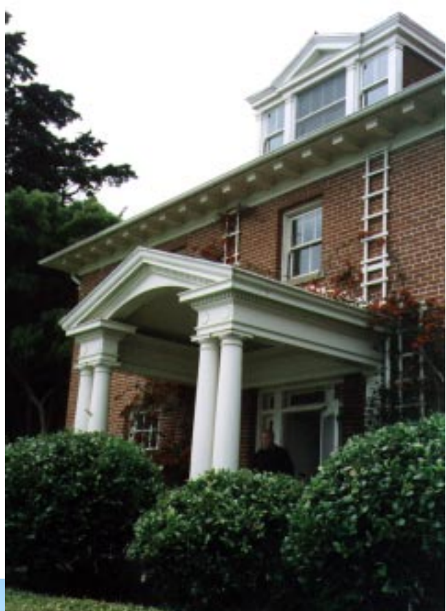
Commanding General's Quarters