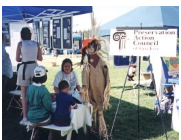
PACSJ Booth at Pumpkins in the Park, October 1999. Children enjoyed coloring Halloween pictures.

October. Visitors to the booth were fascinated with our historic photos and interested in hearing about our efforts to preserve historic structures. A big Thank You to the volunteers who set up and staffed our booth.*<sup>o</sup>