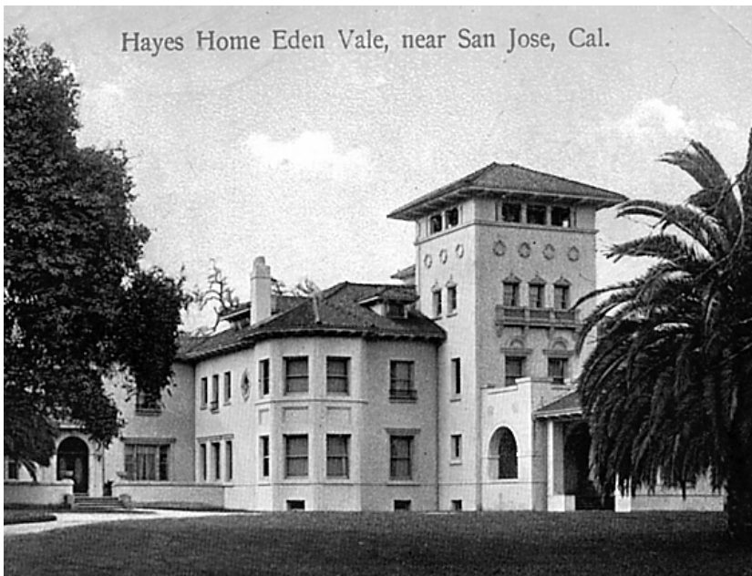
Hayes Mansion c. 1908 Postcard

Page's last project, the first Masonic Temple on St. James Square, was not so fortunate. This classic Greek Revival structure, later known as Eagles' Hall, was razed, leaving only the facade fronting a ten story office building.