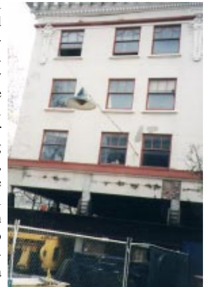
Montgomery Hotel on Wheels

The Montgomery Hotel will have been moved by the time this newsletter is printed and mailed. The move will certainly be a once-in-a-lifetime memory for many of us. The houses in the River Street district are getting some necessary repairs, and plans to convert the massive brick Del Monte Cannery on Santa Clara Street into residential lofts are sailing along. The Letitia Building's renovation is looking beautiful.