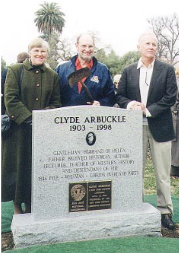
Arbuckle Monument Unveiled