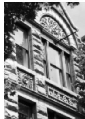
Detail of Knox-Goodrich building