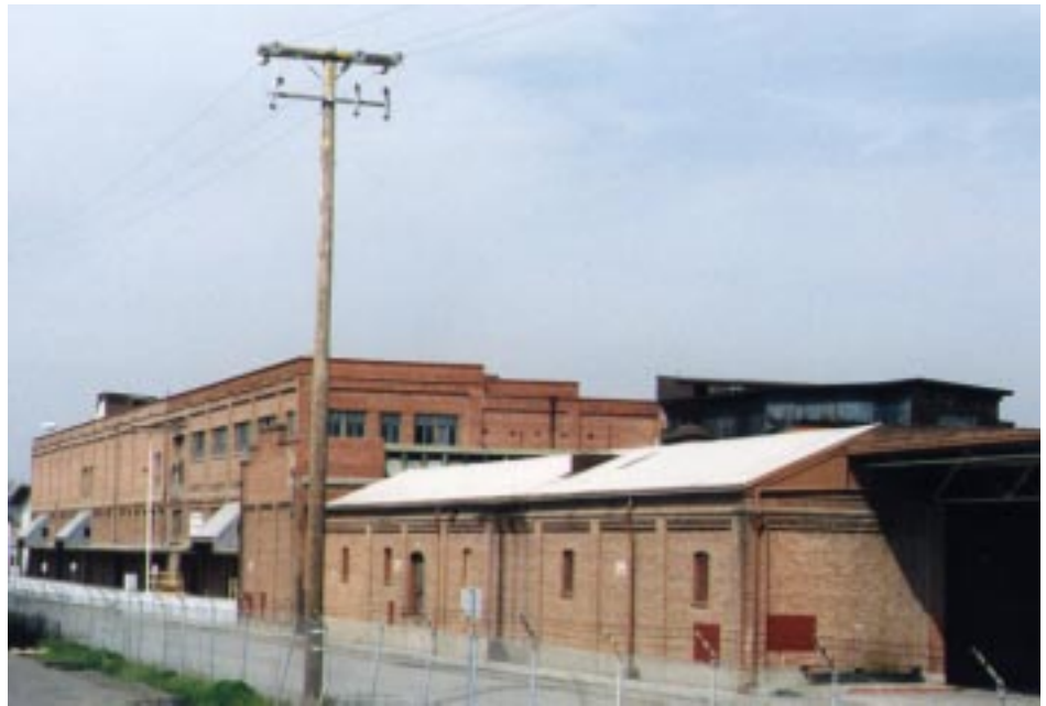
Del Monte Plant #51

Elsewhere on the project's 10.6 acres, there will be an additional 200 residential units, in an architectural style which will coordinate with that of Plant #51. The developer will also donate 2.1 acres to be developed as part of a 5.0 acre turnkey public park. The project was presented to the City of San Jose Planning Commission on January 25th for the zoning permit. It will be presented to HLC and Planning for the Planned Development permit at a later date.