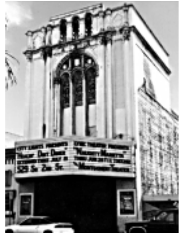
The Fox Theatre

is supposedly planning new digs. The rumor mill's been mighty quiet lately, so figured I'd better do a little nosin' around. Met up with my most dogged undercover agent and he gave me the straight scoop, that is if everything doesn't change again. Word is the existing stage is to be expanded to the north to add depth. The Market Street garage will disappear, and additional