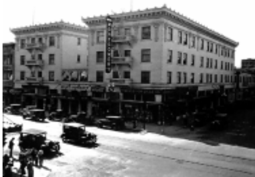
Montgomery Hotel c. 1930

By the time our readers receive this newsletter, work should be well underway to attach the Montgomery Hotel to its new foundation, a complicated procedure in itself. Once the hotel is stabilized at its new site, plans are in place to begin a serious search for a new owner/operator to establish a fine boutique hotel operation to honor the name Montgomery Hotel. PACSJ Board of Directors and members look forward to celebrating the reopening of the Montgomery Hotel. We suggest our readers refer to the Sunday, January 23, 2000 issue of the San Jose Mercury News for a detailed description of the procedures involved in moving and stabilizing this historic structure.