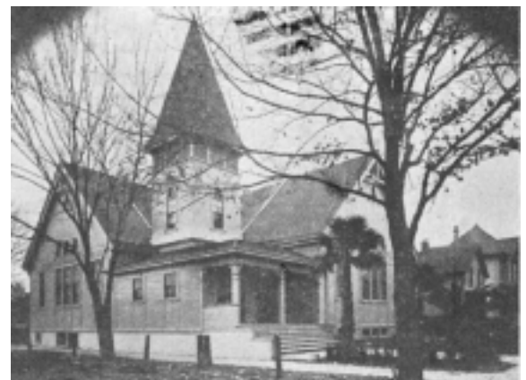
First Congregational Church